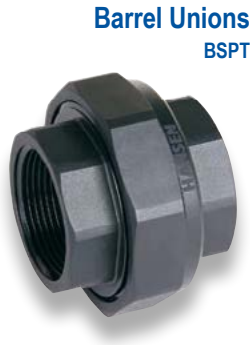
Barrel Unions BSPT

Designed to enable Quick Connect/Disconnect around Pumps, Tanks, Dairy Sheds, Industry and Irrigation.