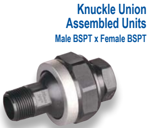
Knuckle Union Assembled Units Male BSPT x Female BSPT

Used to connect and disconnect pipe work or valves quickly and easily from pumps and existing installations. Total of 9 degrees socket movement.