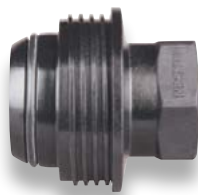
Ball x Female Thread

Used to connect and disconnect pipe work or valves quickly and easily from pumps and existing installations. Total of 9 degrees socket movement.